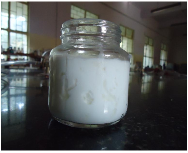
Plate 2: Prepared Kefir